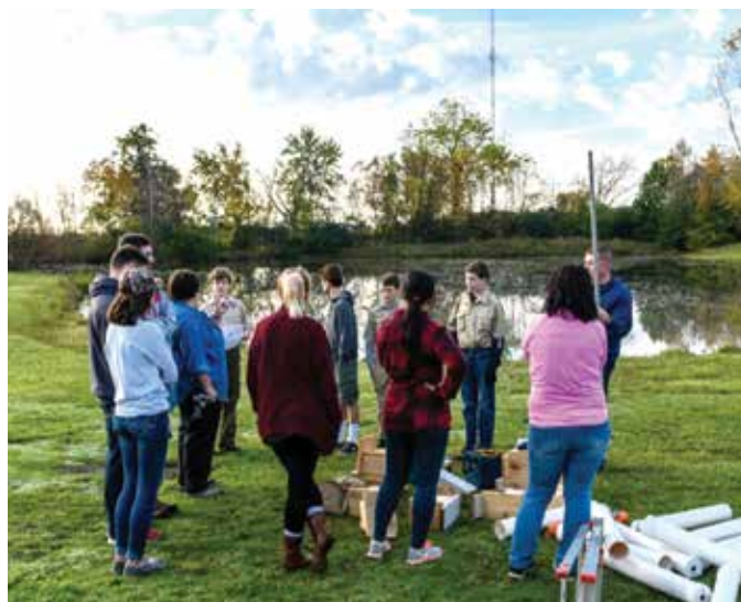
This gives you a sense of the habitat where the boxes were to be installed. Around the pond about every 25 yards, a box was set up for Tree Swallows. They love to hunt over a pond or lake for hatching and flying insects.