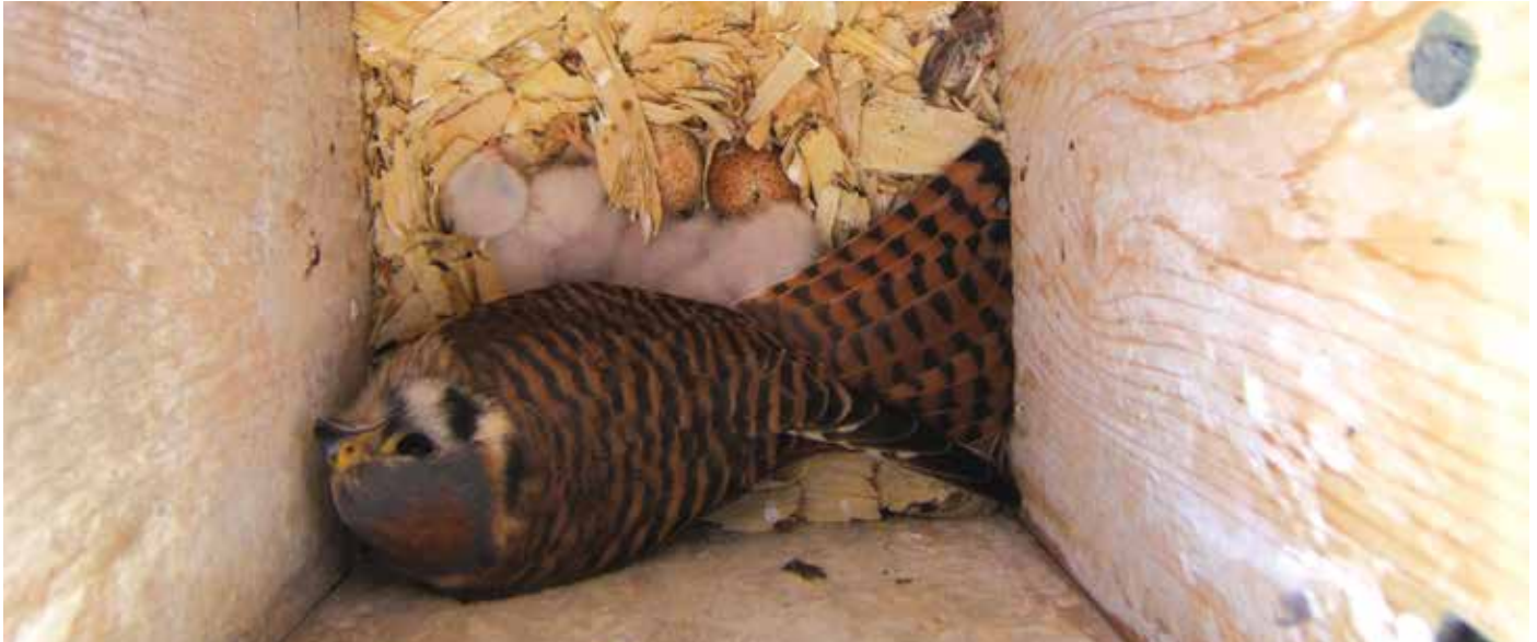
A female kestrel huddled over her hatchlings and eggs as the monster-man in her ceiling took this photo.

Homes for Great Birds; and a custom-built data book for monitors to record their observations. Hopefully, exposure to these books will lead to additional effective conservation projects.