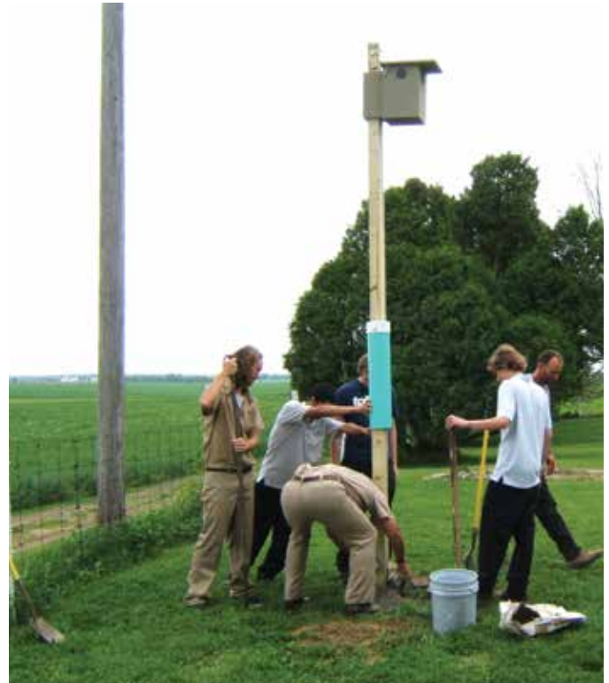
Three carpentry students and two inmates make final adjustments to the powdered concrete around the pole's base on May 18, 2015.

I arrived for my first visit at the prison on January 20, 2015 to meet with Warden Terry Tibbals and his staff and to tour the grounds. By the time I parked my car, I was convinced that all the habitats that I had seen were kestrel-habitats; open grass lands with lots of utility wires; ditches with water; mowed grass; pastures; and meadows with mature, sparse oak trees. Even the prison's tall, anti-climber fence looked kestrel-friendly. And, I had another strong thought as I left